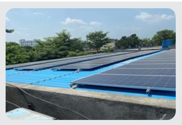
Figure 1: Solar rooftop module

An MSME unit was having an annual electricity consumption of 1 lakh kWh and contract demand of 200 kVA. The unit was drawing power from JBVNL at a tariff of ₹5.50/kWh. A rooftop area of around 6,000 sq. ft was available in the unit. The unit was recommended to install a solar rooftop PV system. Considering the available shed area, the potential of solar rooftop power generation was assessed to be 53.4 kWp.